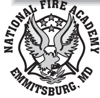
(CLASS NAME) DESIGN 002