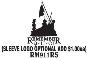
REMEMBER 9-11-01 (SLEEVE LOGO OPTIONAL ADD $1.00ea) RM911RS