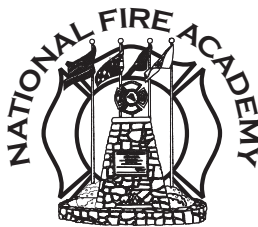
(CLASS NAME) DESIGN 016