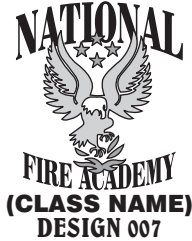
(CLASS NAME) DESIGN 007

#K405 100% COTTON PIQUE GLOFSHIRT W/TIPPED TRIM COLLAR COLOR: Navy Body/Ivory, Black Body/Stone SIZES: XS, S, M, L, XL $22.83 XXL,XXXL $25.15