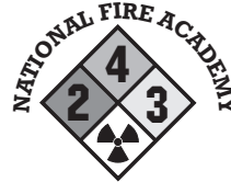
HAZ MAT (CLASS NAME) DESIGN 004